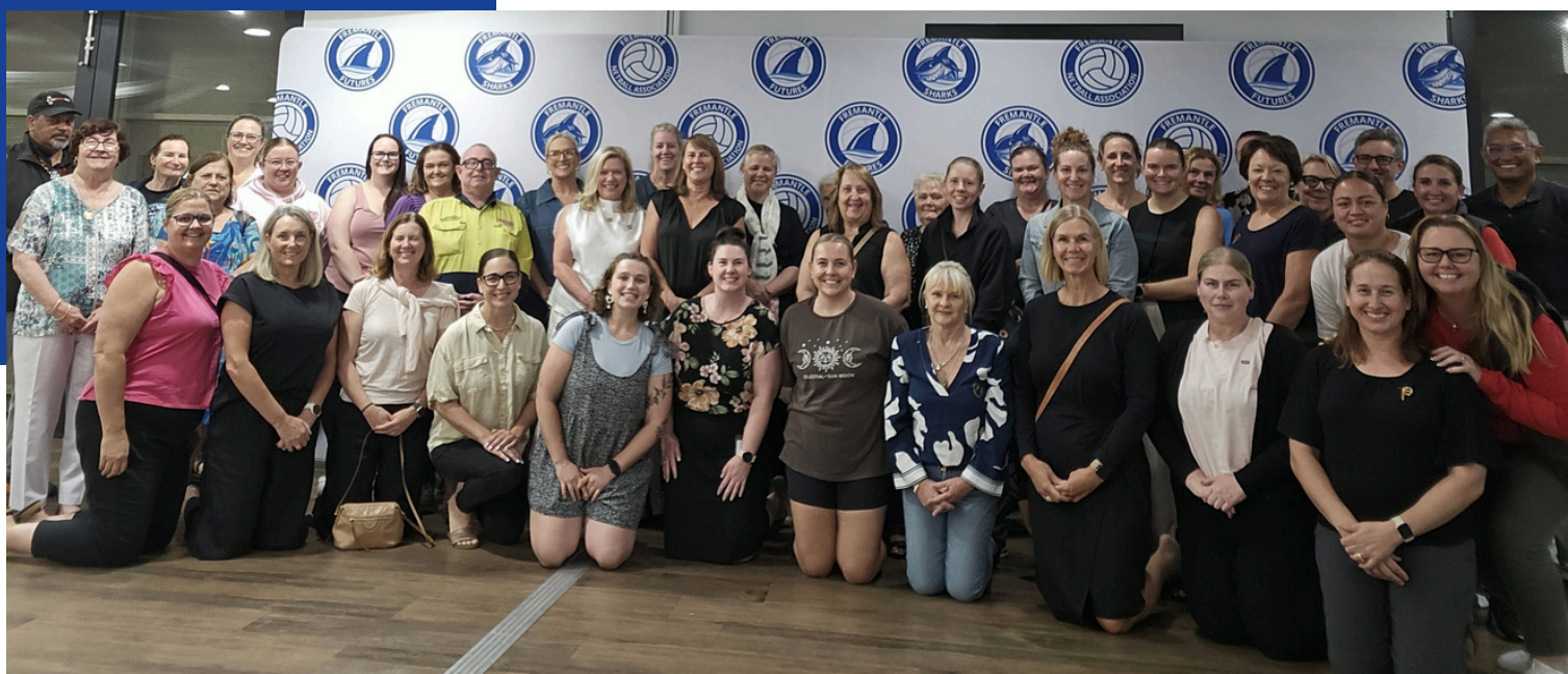
AGM March 2025

It always makes me so proud when I look back on the year and document how much we have achieved. None of us could make this happen without everyone's hard work and for that I am really glad we are on this journey together.